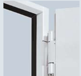
2-mm-thick corner frame with all-round seal

Hörmann also offers its MZ multi-purpose door with glazing. Due to security reasons, this glazing is kept very narrow, but it still lets you benefit from daylight inside. 7-mm wired glass is provided as standard, but 20 mm insulated wired glass with a view of 230 × 1360 mm is also possible. The natural-finish aluminium glazing frame is fastened on the opposite hinge side with glazing beads (optionally on the hinge side).