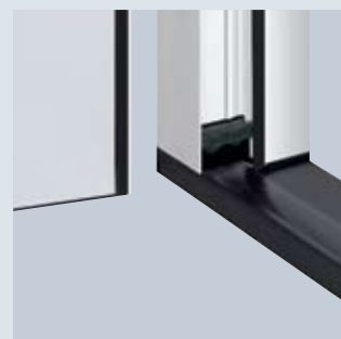
Best thermal insulation thanks to door leaf, frame and threshold with thermal break