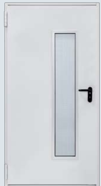
With glazing on request